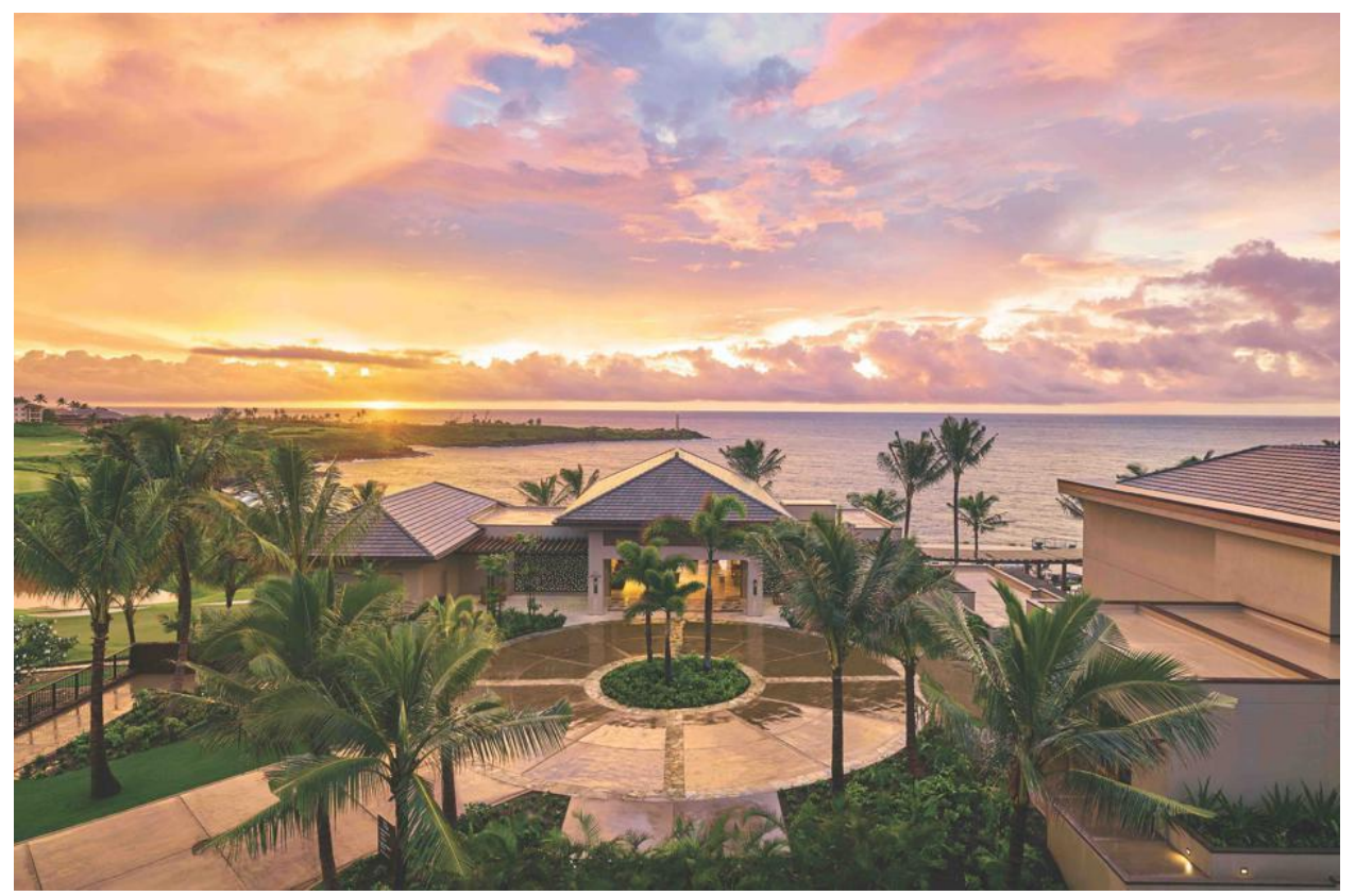
Timbers Kauai at Hokuala on Kauai, one of the top places to go in 2022. TIMBERS KAUAI AT HOKUALA

For those of you who want to explore beyond the U.S., check out <u>"The 22 Best Places To"</u> <u>Travel Around The World In 2022,"</u> where travel experts select the year's most compelling destinations, from Europe to Africa and beyond.