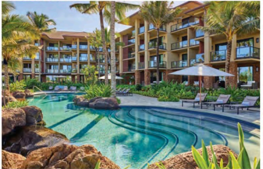
The master-planned development features a Jack Nicklaus signature golf course, miles of winding trails, and more than 40 acres of winding lagoons.